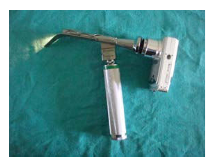
Figure 2 Photograph of the Truview® laryngoscope with camera attachment which clips onto eyepiece.

in a SimMan® manikin (Laerdal®, Kent, UK) in the following laryngoscopy scenarios: (1) normal airway in the supine position; and (2) following the application of a hard neck collar. A maximum of 3 intubation attempts were permitted with each device in each scenario. The primary endpoint was the duration of successful tracheal intubation attempts. The duration of each tracheal intubation attempt was defined as the time taken from insertion of the blade between the teeth until the ETT was deemed to be correctly positioned by each participant. Endotracheal tube placement was determined by each participant by direct visualization. Where the participant was unsure as to the position of the ETT, the time taken to connect the ETT to an Ambu® bag and inflate the lungs was also included in the duration of the attempt. In any case, after each intubation attempt an investigator verified the position of the ETT tip. A failed intubation attempt was defined as an attempt in which the trachea was not intubated, or where intubation of the trachea required greater than 60 seconds to perform.