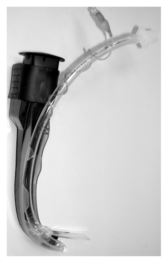
Figure I Photograph of the Airtraq® laryngoscope with a tracheal tube in place in the side channel.

Each AP received a standardized training session with the Airtraq®, the Truview® and the Macintosh laryngoscopes. This included a demonstration of the intubation technique with each device, and verbal instructions regarding the correct use of each device. The use of optimization manoeuvres, such as external laryngeal pressure, to facilitate intubation with the Macintosh was also demonstrated.